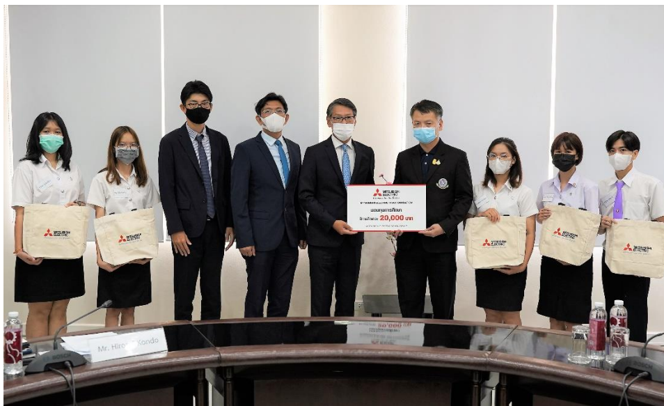
Chiang Mai University